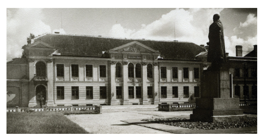
Figure 8. Building of the National Land Bank in Jelgava city, around 1930s [43].

Not all projects developed by I. Blankenburgs were implemented. For example, the implementation of the Daugavpils City 4th Elementary School was delayed due to the fact that the Daugavpils City Board wanted to reduce the estimated construction costs - 350 000 lats, by 40 000 / 50 000 lats. Also, President Kārlis Ulmanis gave instructions on saving money for the construction of new buildings. It was decided that the construction project would be amended, thus reducing the cost of construction works. It was planned to complete the construction of the Daugavpils City 4th Elementary School in autumn 1941 [40]. It is known that in the fall of 1940, with the state powers changed, the Council of People Commissars of the Latvian Soviet Socialist Republic approved the project of the school, drafted by architect A. Borbala [41]. The primary school after the Blankenburgs' project was not realised also in Rauna village, where on 12 December 1938 the Council decided to build a new school after the fire at the Rauna Secondary Elementary School [42]. The political situation changed, and later the Second World War began, the citizens of Rauna lived without a new school until 1956.