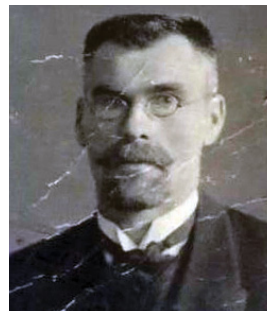
Figure 1. Spricis Paegle (around 1919) [8].

Miķelis Bružis' contemporary Spricis Paegle (1876–1962) also studied chemistry and in 1901 received an engineer's diploma at the Riga Polytechnic Institute. The two were members of the Latvian Student Corporation « Selonija ». Spricis Paegle , who worked in the cement industry before the First World War, held the position of Minister of Trade and Industry (1918–1919) in the First Cabinet of Ministers of the Latvian Provisional Government. He was one of the founders of the Latvian Red Cross and a member of the Main Board (1921–1940), participated in the founding of the Latvian Red Cross School of Merciful Nursing (1920). After the Second World War, S. Paegle lived in Germany [7]. The engineer took active part in various societies, he was into collecting art and gardening. S. Paegle planted extensive alleys of apple trees, lime trees and maple trees, established a tree nursery at his homeland in Kalnabeites village ( Sigulda municipality). There were about 10 000 different trees and shrubs in the garden.